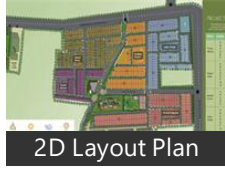
2D Layout Plan