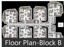
Floor Plan-Block B