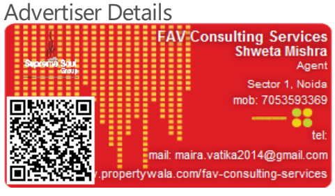
Scan QR code to get the contact info on your mobile View all properties by FAV Consulting Services