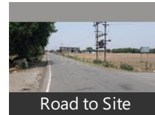
Road to Site