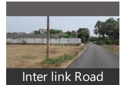
Inter link Road