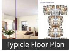
Typicle Floor Plan