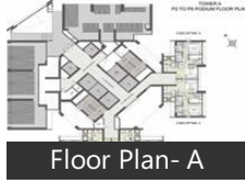
Floor Plan- A