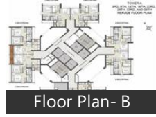
Floor Plan- B