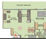
Type 1 Floor Plan