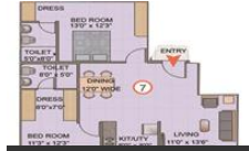
Type 4 Floor Plan