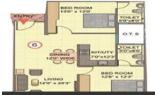
Type 3 Floor Plan