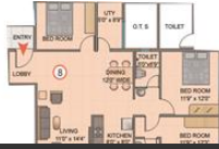
Type 5 Floor Plan