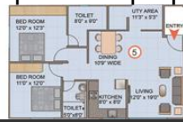
Type 2 Floor Plan