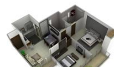
Floor Plan 2