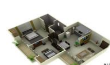
Floor Plan 4

* These floor plans are of the project and might not represent the property