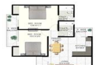
Floor Plan 3