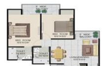
Floor Plan 1