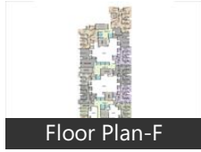
Floor Plan- F