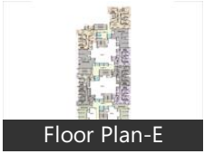
Floor Plan- E