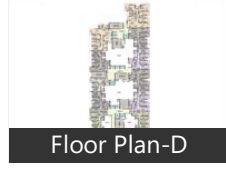
Floor Plan- D