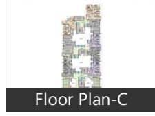
Floor Plan- C