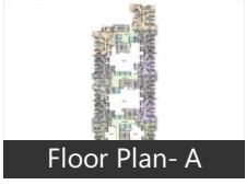
Floor Plan- A