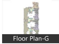
Floor Plan- G