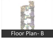
Floor Plan- B