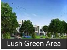
Lush Green Area