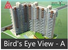
Bird's Eye View - A