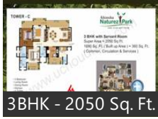
3BHK - 2050 Sq. Ft.