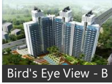
Bird's Eye View - B