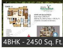
4BHK - 2450 Sq. Ft.