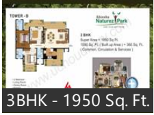
3BHK - 1950 Sq. Ft.