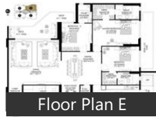
Floor Plan E