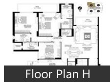
Floor Plan H