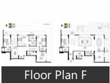
Floor Plan F