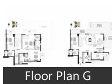
Floor Plan G