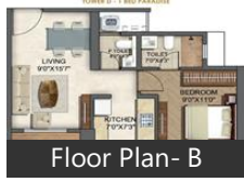
Floor Plan- B