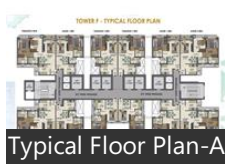
Typical Floor Plan-A