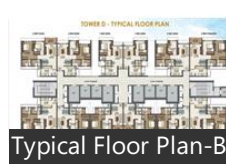
Typical Floor Plan-B