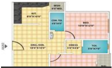
Floor Plan 2