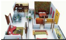
3D Floor Plan 2