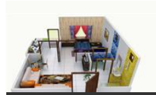
3D Floor Plan 1