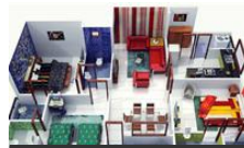
3D Floor Plan 3