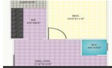
Floor Plan 1