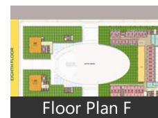
Floor Plan F

* These floor plans are of the project and might not represent the property