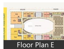
Floor Plan E