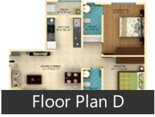
Floor Plan D