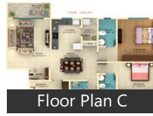
Floor Plan C