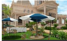
Park with Sitting