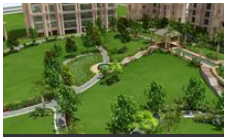
Garden with Tower