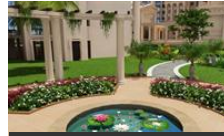
Decoration View in