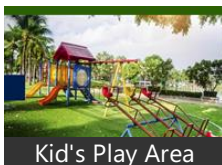
Kid's Play Area