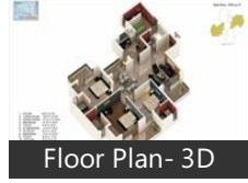
Floor Plan- 3D