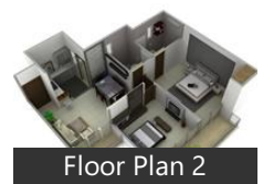
Floor Plan 2