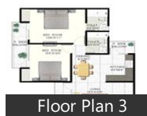
Floor Plan 3