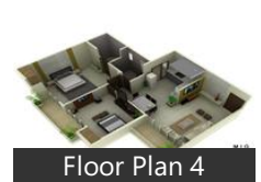
Floor Plan 4

* These floor plans are of the project and might not represent the property