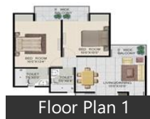
Floor Plan 1