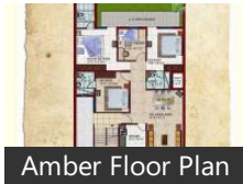
Amber Floor Plan