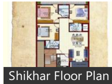
Shikhar Floor Plan