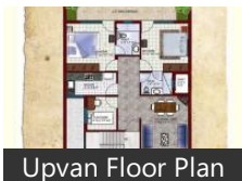
Upvan Floor Plan