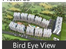
Bird Eye View