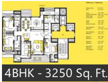
4BHK - 3250 Sq. Ft.