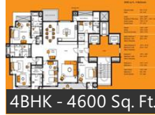
4BHK - 4600 Sq. Ft.