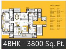
4BHK - 3800 Sq. Ft.