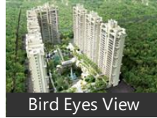
Bird Eyes View