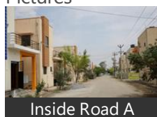
Inside Road A