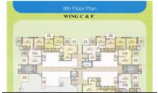
8Th Floor Plan