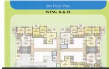
8Th Floor Plan