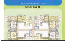
Typical Floor Wing