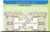
Typical Floor Wing