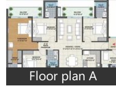
Floor plan A