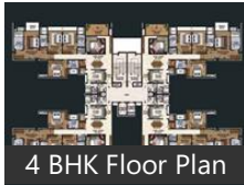
4 BHK Floor Plan