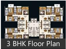
3 BHK Floor Plan