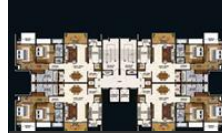
2 BHK Large Floor