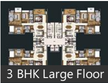
3 BHK Large Floor