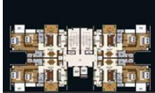
2 BHK Floor Plan