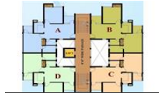
2BHK - Type I