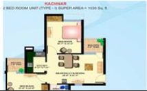
2BHK - 1035 Sq. Ft.