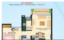
1BHK - 779 Sq. Ft.