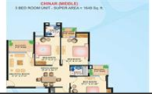
3BHK - 1649 Sq. Ft.