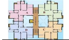
3BHK - Typical Floor