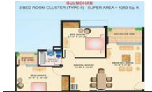
2BHK - 1250 Sq. Ft.