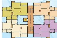
2BHK - Type II