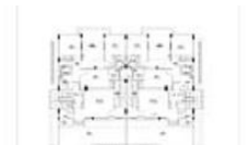
3rd Floor Plan