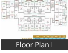
Floor Plan I