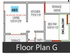
Floor Plan G