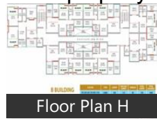
Floor Plan H