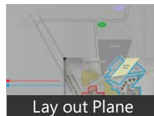
Lay out Plane