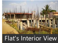
Flat's Interior View