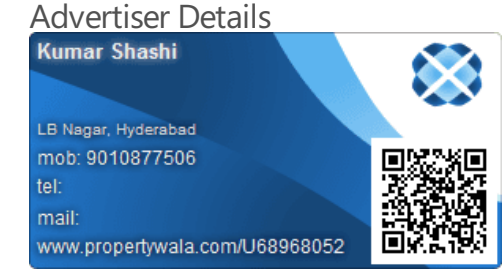
Scan OR code to get the contact info on your mobile