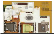
2BHK - Floor Plan