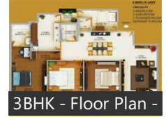
3BHK - Floor Plan -