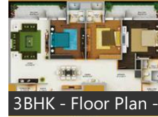
3BHK - Floor Plan -