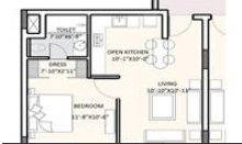
1BHK Layout Plan

* These floor plans are of the project and might not represent the property