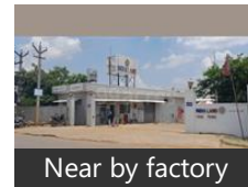
Near by factory