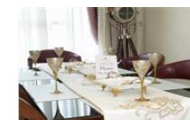
Leela Orchid Greens