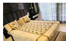
Leela Orchid Greens