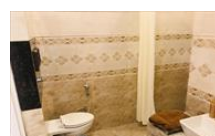
Leela Orchid Greens