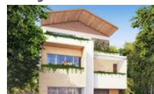
Wave Estate Villas