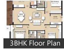
3BHK Floor Plan

* These floor plans are of the project and might not represent the property