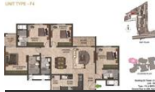
Floor plan G