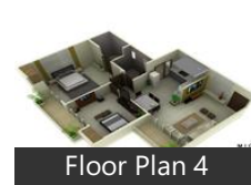
Floor Plan 4

* These floor plans are of the project and might not represent the property