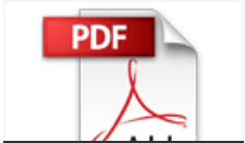
Route Map Driving