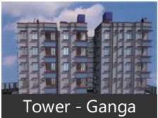
Tower - Ganga