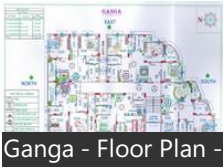
Ganga - Floor Plan -