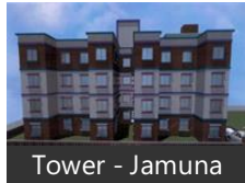
Tower - Jamuna