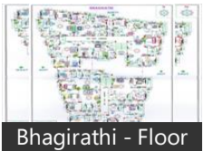
Bhagirathi - Floor