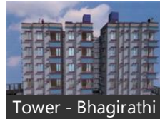
Tower - Bhagirathi