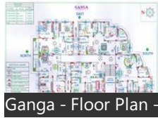
Ganga - Floor Plan -