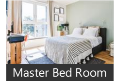
Master Bed Room

* These pictures are of the project and might not represent the property