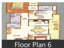
Floor Plan 6