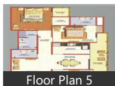
Floor Plan 5