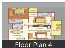
Floor Plan 4