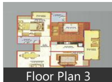
Floor Plan 3