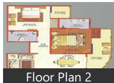
Floor Plan 2