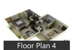
Floor Plan 4

* These floor plans are of the project and might not represent the property