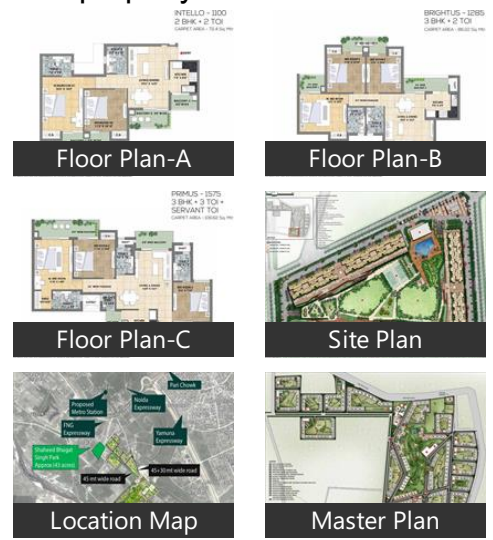
* These floor plans are of the project and might not represent the property