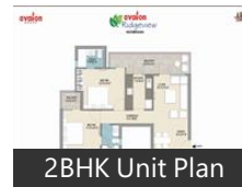
2BHK Unit Plan

Disclaimer: The reviews are opinions of PropertyWala.com members, and not of PropertyWala.com.