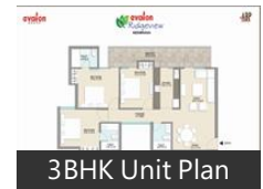
3BHK Unit Plan

* These floor plans are of the project and might not represent the property