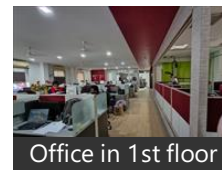
Office in 1st floor