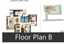
Floor Plan B