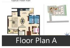
Floor Plan A