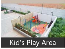
Kid's Play Area