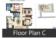
Floor Plan C