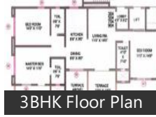
3BHK Floor Plan