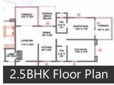
2.5BHK Floor Plan