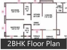
2BHK Floor Plan