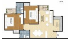
2 BHK Floor Plan