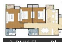
3 BHK Floor Plan